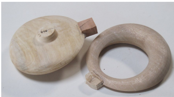
3. Hot glue on the waste block on the narrow end. Prototype on the right.