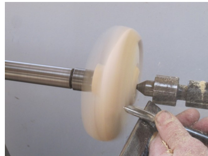
2. Offset and turn the shape from both sides, first on centres 2, then on Centres 3