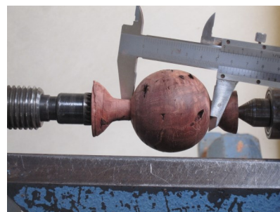
6. Turn the sphere between centres, check with callipers