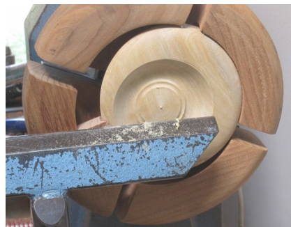
4. Place in wood jaws and turn the inside from either side.